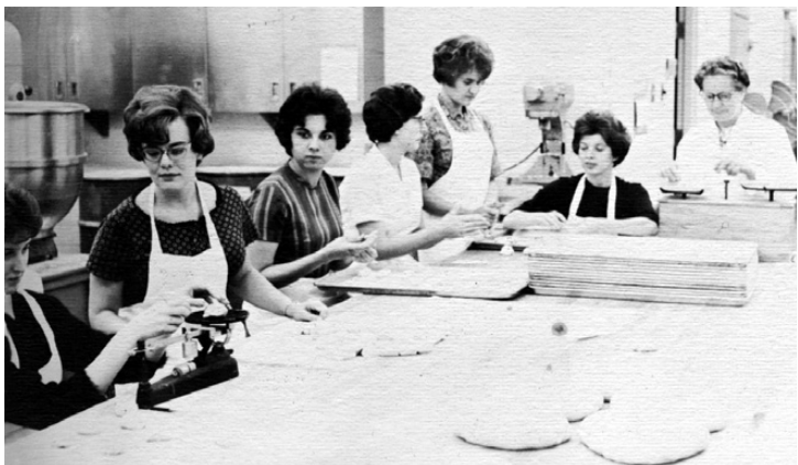
Above: The food preparation team fixes carefully weighed meals for the Nutrinauts.