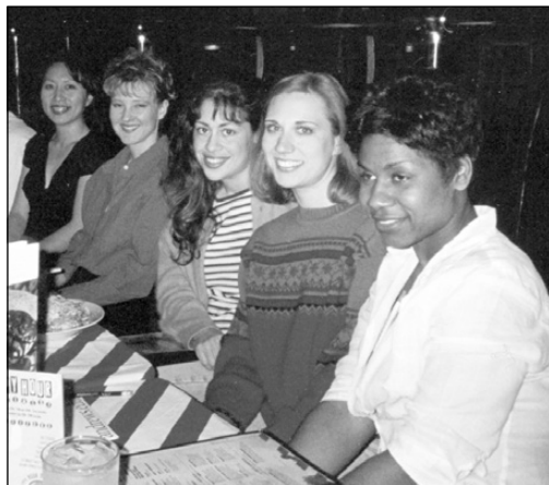
LOMA LINDA: Young alums catch up with Andrews at TGI Friday's.