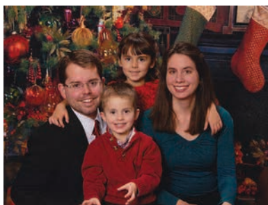
The Campbell Family