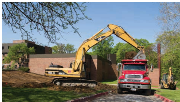
Groundbreaking for the new residence hall tower took place on April 30, 2010

The final action item was the introduction of the proposed alliance of Griggs University