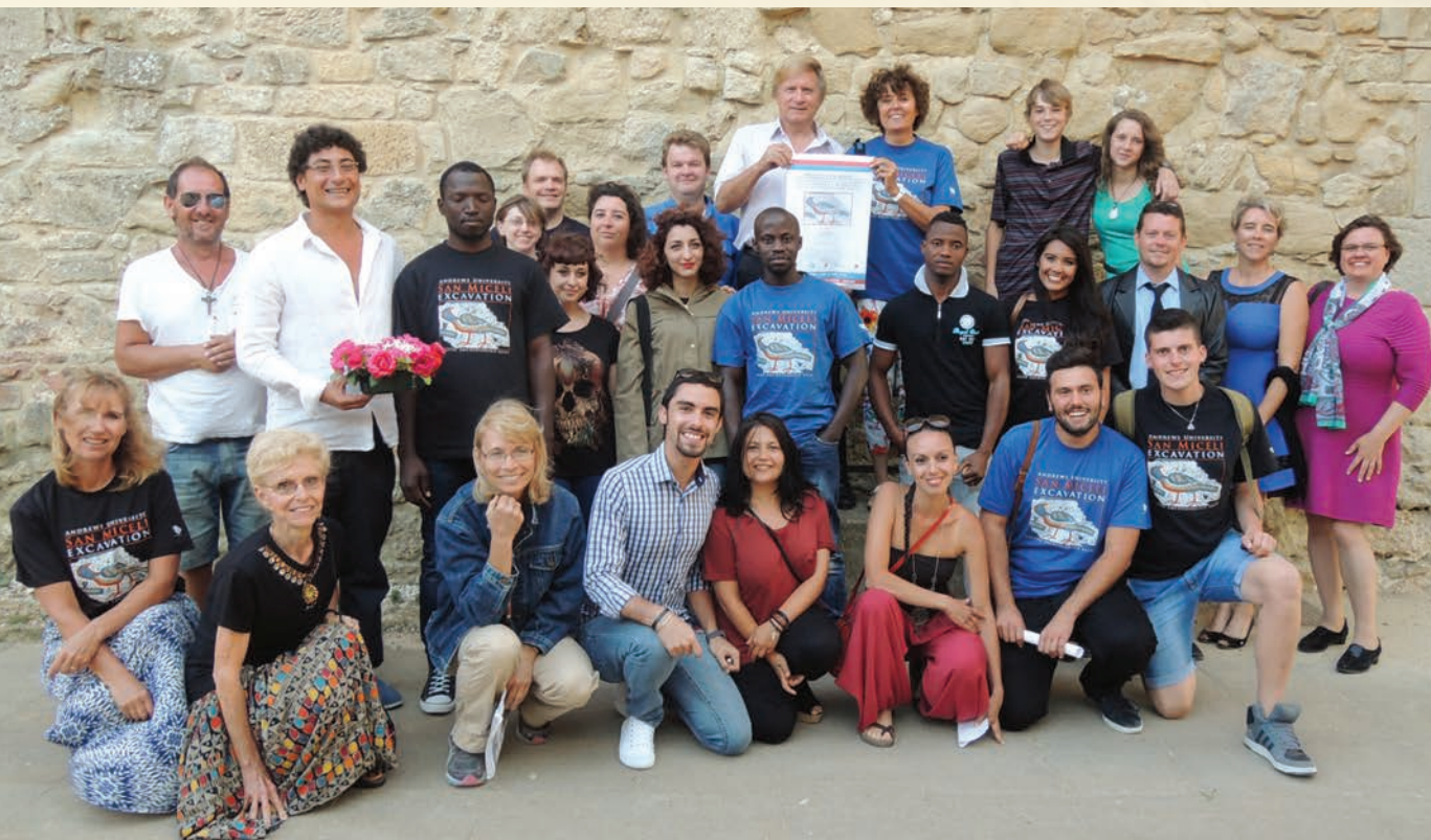
The team at the 2015 San Miceli Conference in Sicily.

Andrews University, through the Madaba Plains Project 2 , has had a presence in Transjordanian archaeol-