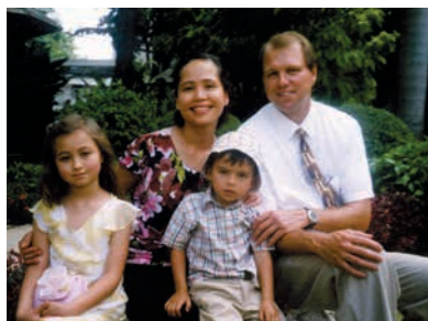
The Hamann family