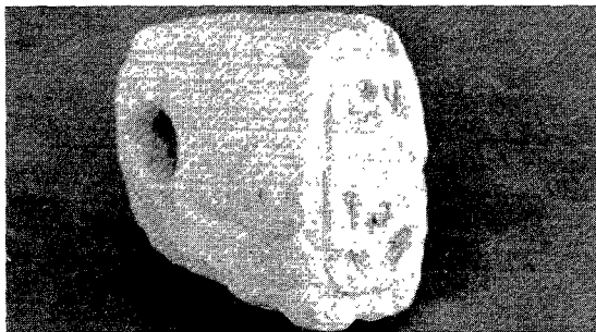
An Iron Age seal from the time of the judges.

Beyond this, certain zooarcheological and other environmental fieldwork is