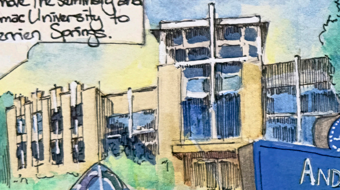
OCT. 1888 - G.C. votes to move the seminary and Potomac University to Berrien Springs.