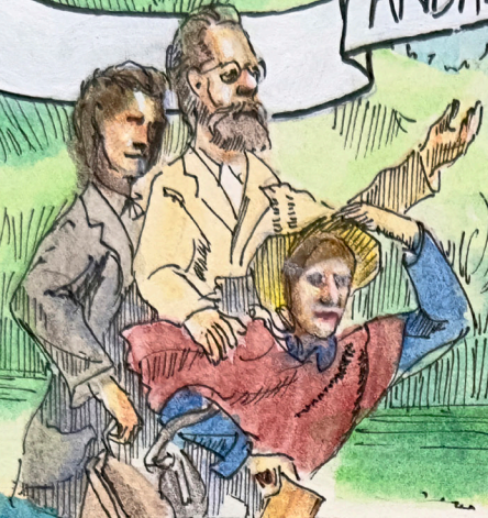
AUG 1874 - Classes begin in the Review and Herald building in Battle Creek