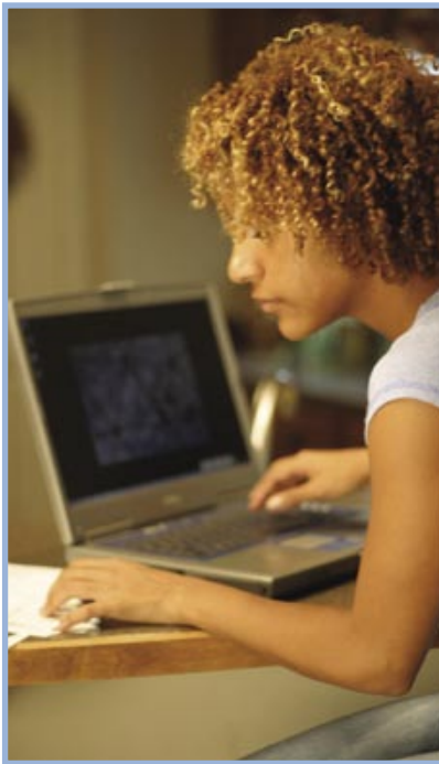
AU now offers a completely online Master of Science in Nursing Education degree program.

This venue is great for the working parent who can only devote time for education in the evening or on weekends. The program is designed in an intensive format. Students take one class per month, completing a new class every five weeks. The program can be finished in a minimum of five semesters.