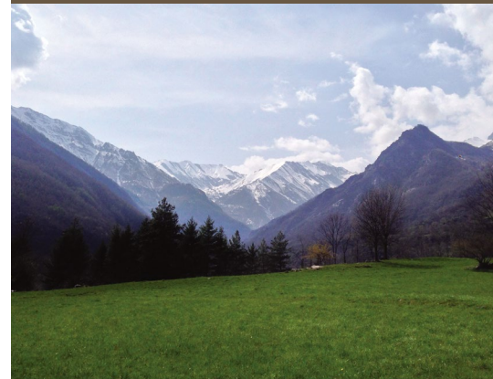
The Alpine meadows in spring against the snow capped mountains. The mountain on the right is the Barion near the village of Bobbio Pellice, where Catholics pursued Waldenses during times of persecution, throwing them from the top of that mountain.