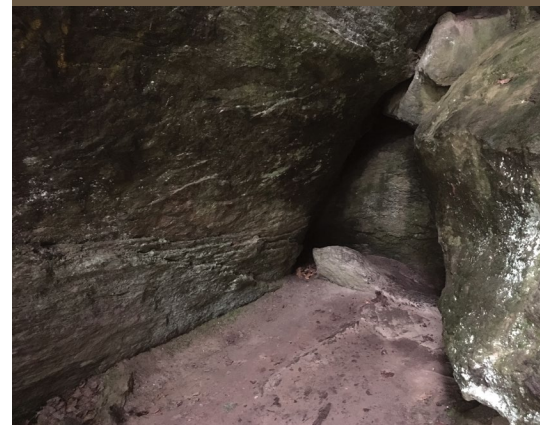
The entrance of a cave in the Valley of Angronia near Torre Pellice, where Waldenses worshiped during times of persecution. It could contain about 200 persons. When discovered they were smoked out and died of suffocation.