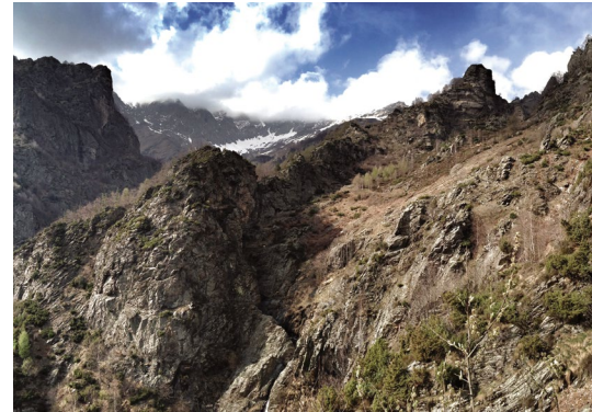
The rugged Alpine mountains, a place of refuge for the Waldenses

One of the most significant primary source evidences for the presence of a substantial group of Waldensian Sabbath keepers during the first half of the thirteenth century was brought