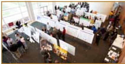
More than 120 poster and video presentations covering a wide range of topics filled the lobby of the Howard Performing Arts Center.

Andrews University's first Celebration of Research and Creative Scholarship was held on Thursday, Apr. 2, in the Howard Performing Arts Center. This scholarly event was jointly sponsored by the Office of Research & Creative Scholarship and the Office of the Provost.