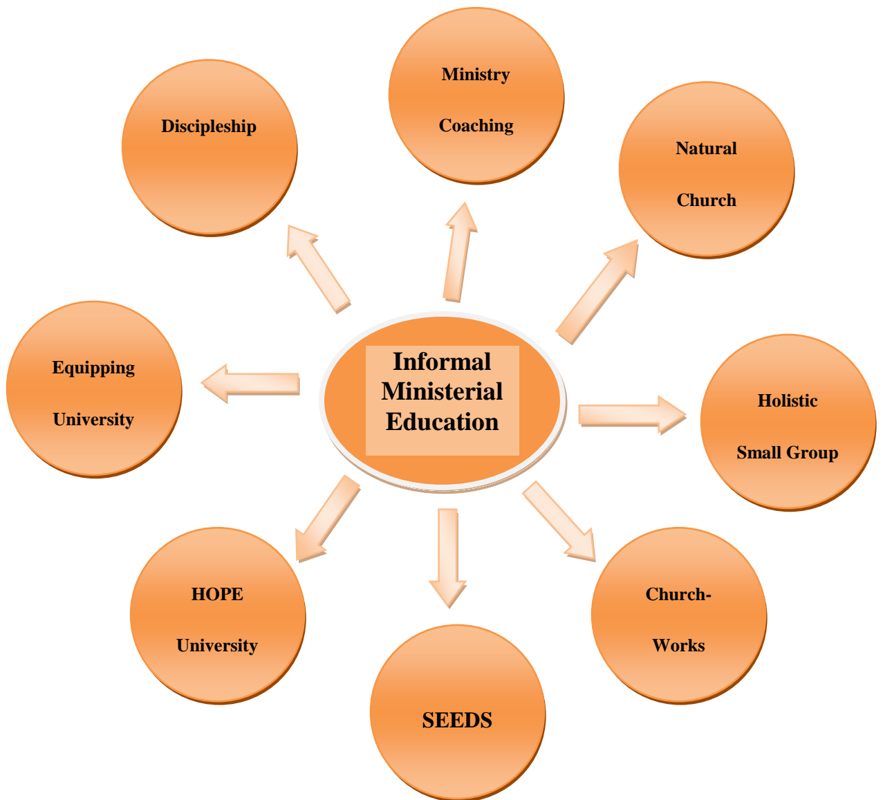
Figure 1. Dynamics of informal ministerial education.

Conferences, that falls into the category of established programs. Therefore, the evaluation of SEEDS Conference has been the primary focus of the evaluation of informal curriculum.