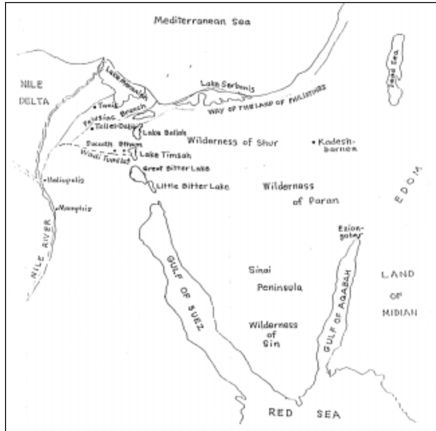
Fig. 1. A general map of the area at the time of the Exodus, showing most of the toponyms mentioned in this paper. The dotted line represents the Wadi Tumilat. This map also shows the location of Lake Ballah and Lake Timsah, one of which may be the "sea" the Israelites crossed over.

A. Rameses. In Exodus 12:37 and Numbers 33:3, the Israelites started their journey from the Egyptian city of Rameses. However, employing the name Rameses does not mean the Exodus happened during the time of Rameses II, the pharaoh the city was named after. Gen 47:11 records how Joseph and his brothers, together with his father Jacob, settled in the "district of Rameses." This is evidence that the mere presence of the name of Rameses II of the 19th Dynasty does not mean the place called Rameses existed in the time of Joseph, any more than the settlement of Joseph and his father and brothers happened in the 19th Dynasty.