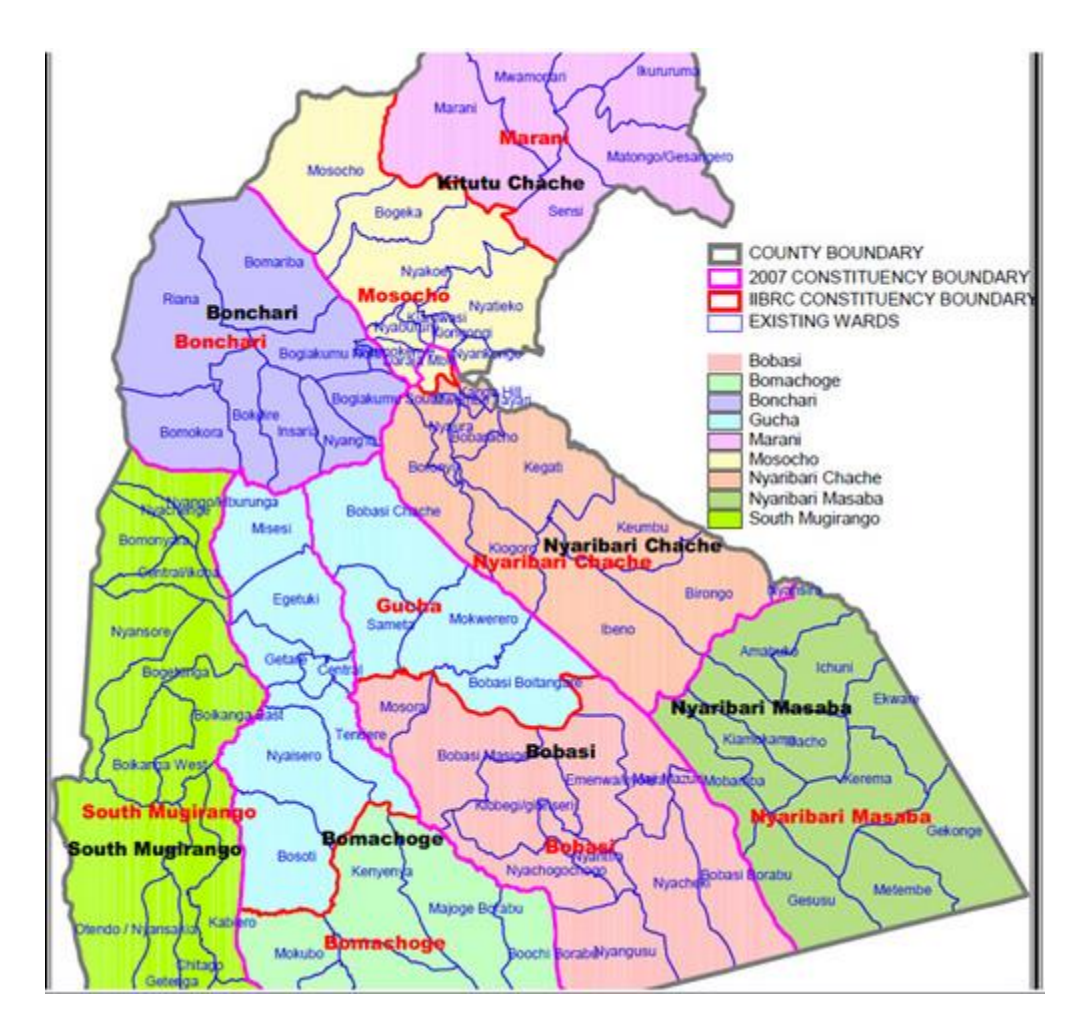
Figure 2. Map of Kisii County.