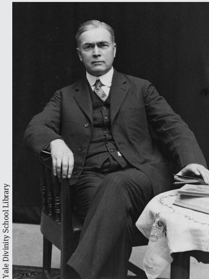
Yale Divinity School Library

did not use his natural gifts cheaply for quick and shallow successes. The gifts he had were matched by “his almost infinite capacity for hard work and care for details” (Hopkins, 1979, p. 31). Throughout his long career, Mott used and developed his God-given leadership skills at a very high level.