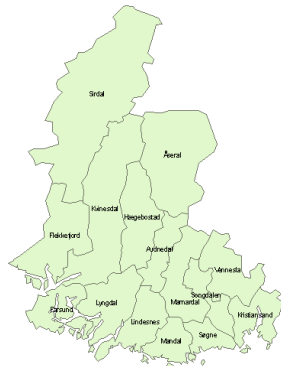
Sirdal within Vest-Agder

Bakke is a former municipality in Vest-Agder county. It is located along the eastern shore of Lundevatn along the Rogaland County border (FamilySearch.org; Wikipedia).