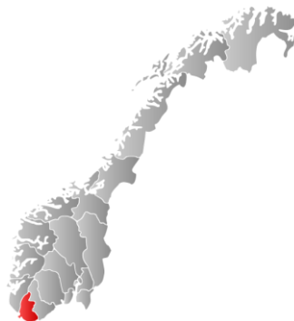
Vest-Agder within Norway

Vest-Agder is the southernmost county in Norway bordered by Rogaland on the west and Aust-Agder to the east. Most of the population is along the coast. Sirdal is part of the mountainous and sparsely settled region in the north.