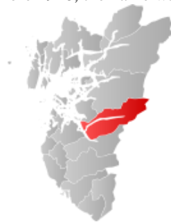
Forsand in Rogaland County

Forsand Parish is now part of the Hogsfjord Kommune. Forsand and Hole parishes were part of the Strand Parish until 1864. Forsand was separated from Høle on January 1, 1871. The municipality (originally the parish) is named after the old Forsandr farm (Old Norse: Forsandr ), since the first church was built there. The first element is the prefix for which means "outsticking" and the last element is sandr which means "sand" or "sandy beach". Before 1918, the name was written " Fossan " (Wikipedia).