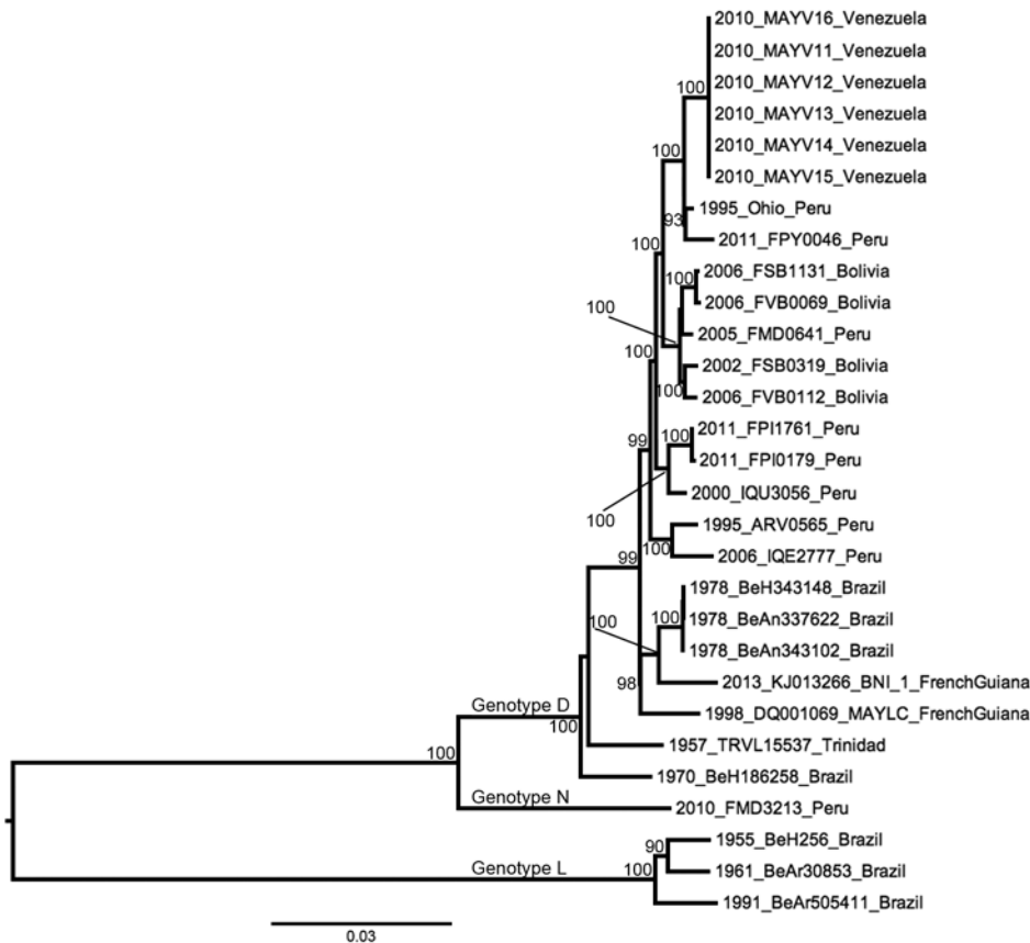
Figure 2. Midpoint-rooted maximum-likelihood phylogeny of 29 Mayaro virus strains on the basis of complete genome sequences, Venezuela, 2010. Nodes are labeled with bootstrap values \geq 90\% . Tip labels indicate year of isolation, strain name, and country of isolation. Scale bar indicates percentage nucleotide sequence divergence. Isolates DQ001069 and KJ013266 were previously sequenced and obtained from GenBank.

Nonsynonymous mutations that defined a specific group, clade, or lineage were identified manually. Uninformative mutations were not counted; only synapomorphies that were unique to a group or cluster were noted. There were 143 nonsynonymous synapomorphic mutations of interest, of which 114 were unique to genotype L. The 5 amino acid positions that were detected to be under positive selection and to delineate the genotype L strains were Leu→Ala/Val at position 518 in NSP1; Ala→Pro and Val→Thr at positions 298 and 386 in NSP3, respectively; Ala→Lys at position 249 in NSP4; and Leu→Thr at position 300 in the E1 protein.